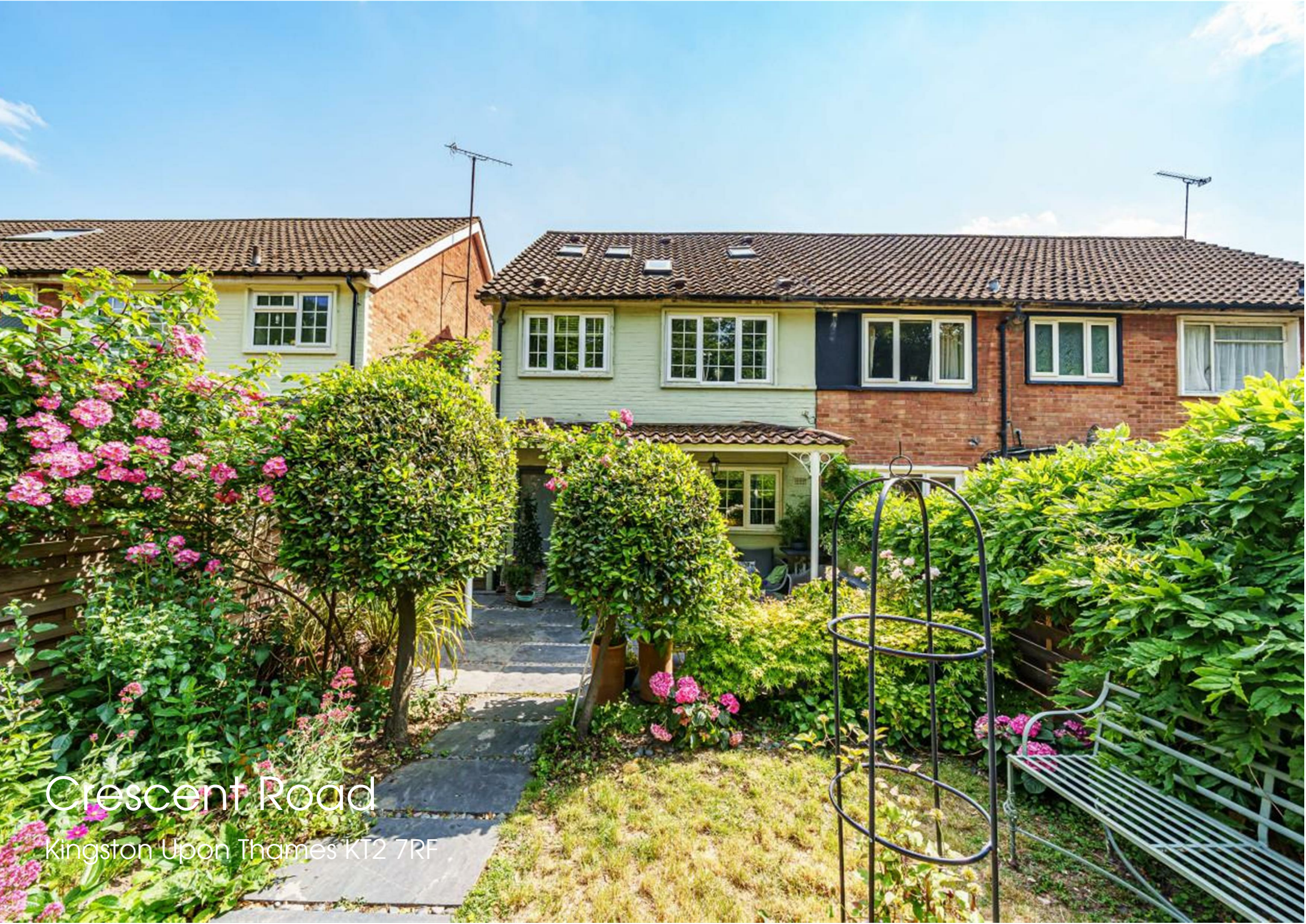
Crescent Road Kingston Upon Thames KT2 7RF